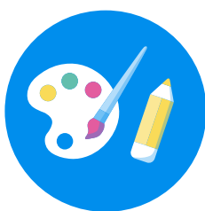
Painting and drawing